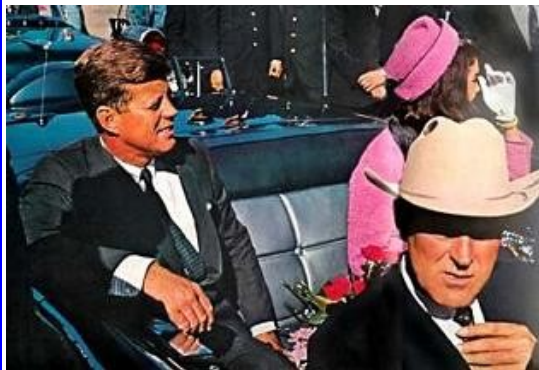
The fateful day, The Kennedy's and the Connally's.

10. Election Night, Victory Party: Jimmy Carter conceded 3 hours before they had planned! Talk about not prepared, so they got 3 extra hours for their celebration.