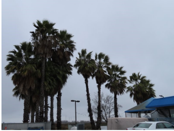
Bending Palm trees. Uh oh!