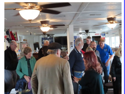
Fellowship abounds with the sign of Peace!