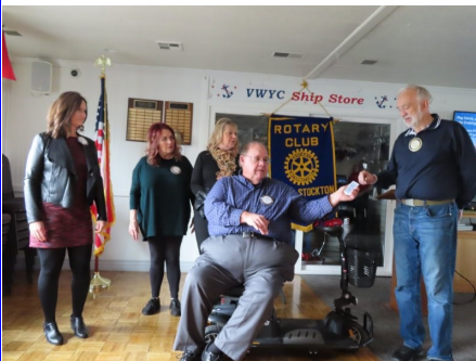
Nothing in my right hand...