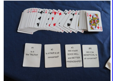
Four Way Test Magic!!!